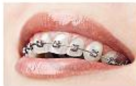
Treatment with braces