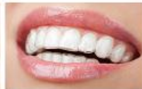
Treatment with clear-line